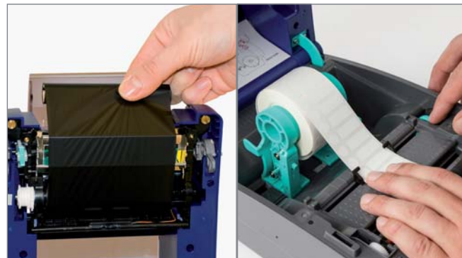
Step 1: Insert media