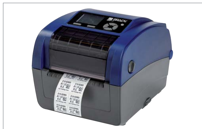
Step 3: Print