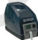
IPT Series PRINTER