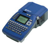
BMP™51 LABEL MAKER