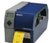
BradyPrinter™ BP-PR PLUS Printer HEAVY DUTY MEETS HIGH TECH