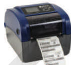
BBP™12 LABEL PRINTER