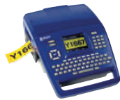
BMP™71 LABEL PRINTER